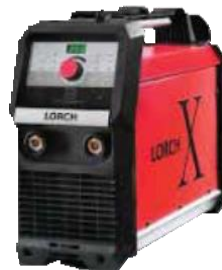
X 350 X 350