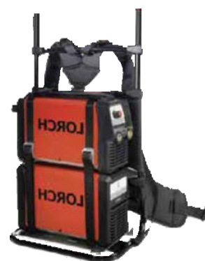
MicorStick 160 Accu Ready